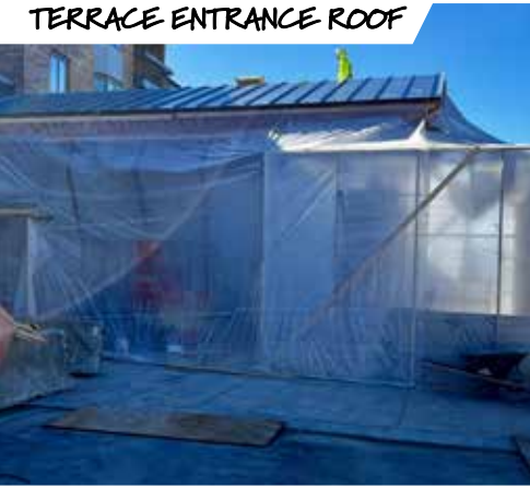
TERRACE ENTRANCE ROOF