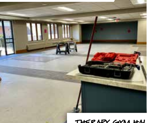
THERAPY GYM MAIN SPACE