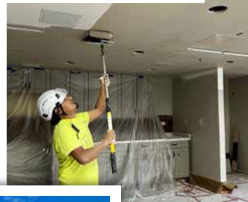
THERAPY GYM BEING PAINTED