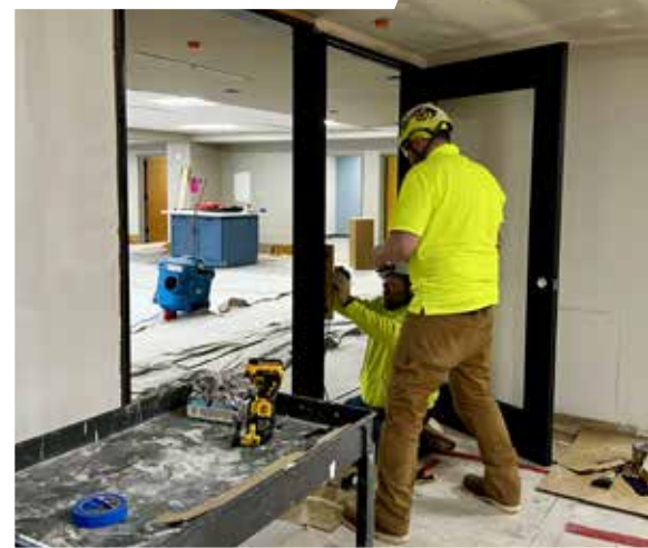
THERAPY GYM ENTRANCE