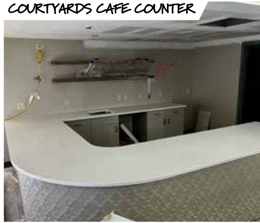
COURTYARDS CAFE COUNTER