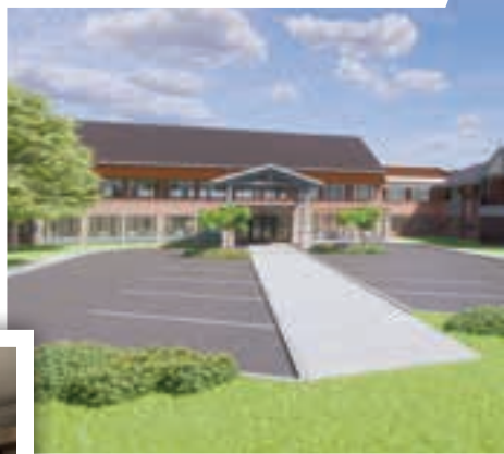
THE COURTYARDS ENTRANCE