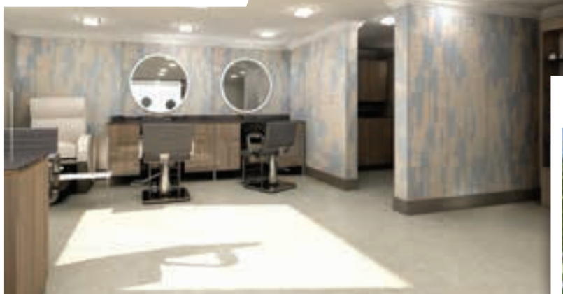
THE COURTYARDS SALON