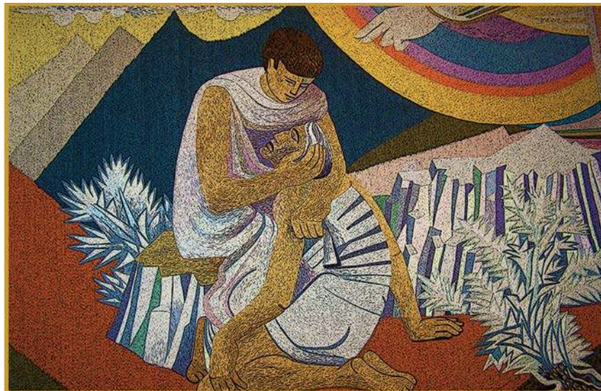
📖 & WHEN HE SAW HIM, HE HAD COMPASSION 📖 Luke 10:33

As our Christmas card said this year "and when he saw him. He had compassion" God bless you all and Merry Christmas!